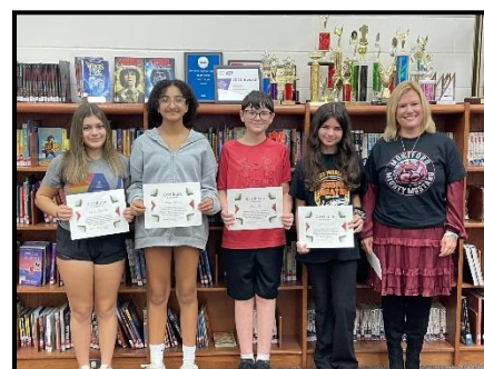
Mighty Mustang winners show their certificates of achievement

Mustangs are chosen to have a lunch meeting with the P.T.S.O. to help represent the student body while they discuss plans for school activities.