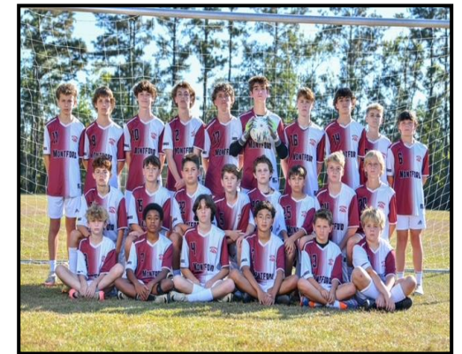
2025 District Boys Soccer Championship Team