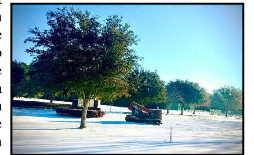
Glistening white snow blankets the campus the morning of January 22 nd