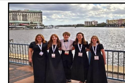
Students pose in front of the Tampa Convention Center